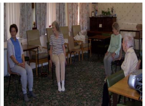
You could be keeping as fit as these ladies at the Westbournes – contact us to find out how?